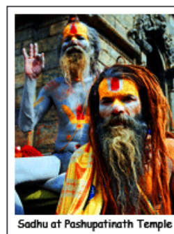
Sadhu at Pashupatinath Temple