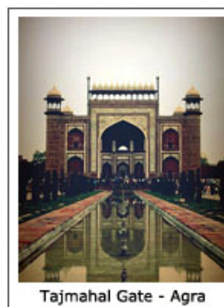
Tajmahal Gate - Agra