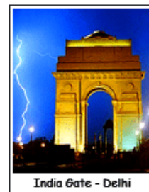
India Gate - Delhi

Morning free. Afternoon transfer to airport to catch flight for Khajuraho. Arrival at Khajuraho and transfer to hotel. Overnight stay at the hotel.