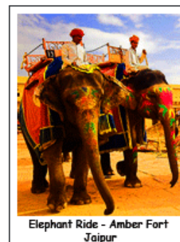
Elephant Ride - Amber Fort Jaipur