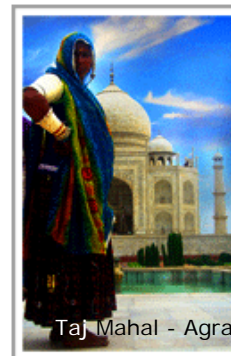
Taj Mahal - Agra