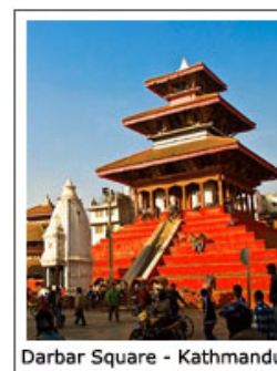
Darbar Square - Kathmandu