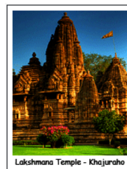
Lakshmana Temple - Khajuraho