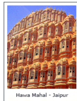
Hawa Mahal - Jaipur

05 Breakfast at the hotel followed by a full day sight-seeing tour of Jaipur visiting Hawa Mahal -- The Palace of Winds, The Jantar Mantar, The City Palace and the Amber Fort. Your tour includes a ride up the Fort on an Elephant's back. Overnight in Jaipur.