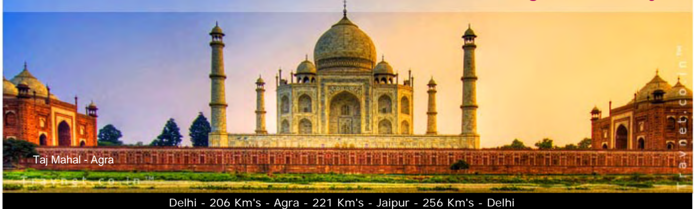
Taj Mahal - Agra

Delhi - 206 Km's - Agra - 221 Km's - Jaipur - 256 Km's - Delhi