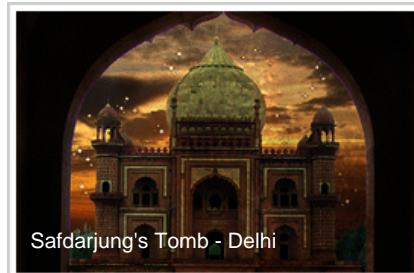
Safdarjung's Tomb - Delhi

01 You will be met on your arrival at Delhi International Airport and transferred to the hotel of your choice. Overnight in Delhi.