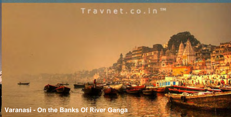
Varanasi - On the Banks Of River Ganga

Delhi - 256 Km's - Jaipur - 221 Km's - Agra - 577 Km's - Varanasi - 780 Km's - Delhi