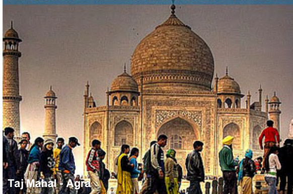
Taj Mahal - Agra