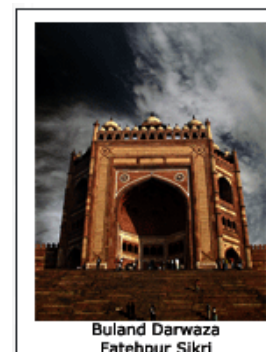
Buland Darwaza Fatehpur Sikri

Morning driver to Agra. Stop enroute and visit Fatehpur Sikri, city built in red sandstone by Emperor Akbar. The proceed to Agra. On arrival check in at the Hotel. Overnight stay at the Hotel.