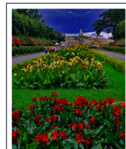
Lalbagh - Bangalore

Morning city tour. Visit City Palace, Beautiful Vrindavan Gardens and Chamundi Temple. Afternoon free for independent activities. Overnight stay.