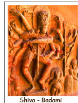
Shiva - Badami