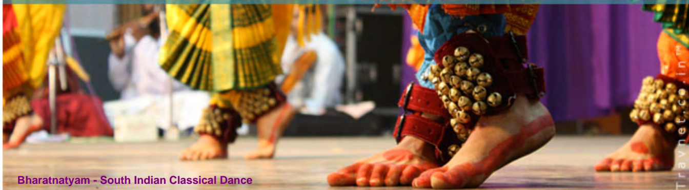
Bharatnatyam - South Indian Classical Dance

Bangalore - 135 Km's - Mysore - 115 Km's - Hassan - 439 Km's - Hampi - 175 Km's - Badami - 128 Km's - Hubli - 187 Km's - Goa - 593 Km's - Mumbai