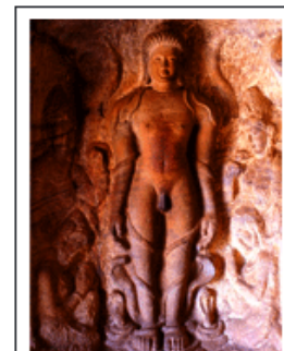
Mahaveer - Badami

Morning sightseeing tour of Hampi which is the 14th century capital of Great Vijayanagar Empire. Visit Vitthal Temple, Queen's Bath & Lotus Mahal. Afternoon free. Overnight stay at the hotel.